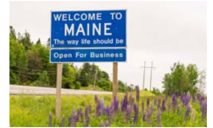
MAINE HAS LONG BEEN A SOUGHT-AFTER VACATION DESTINATION.

class Mainers while vacation homes sit empty for months at a time. Many rental owners, however, point to the larger housing crisis, in which short-term rentals seem to only be a small problem.