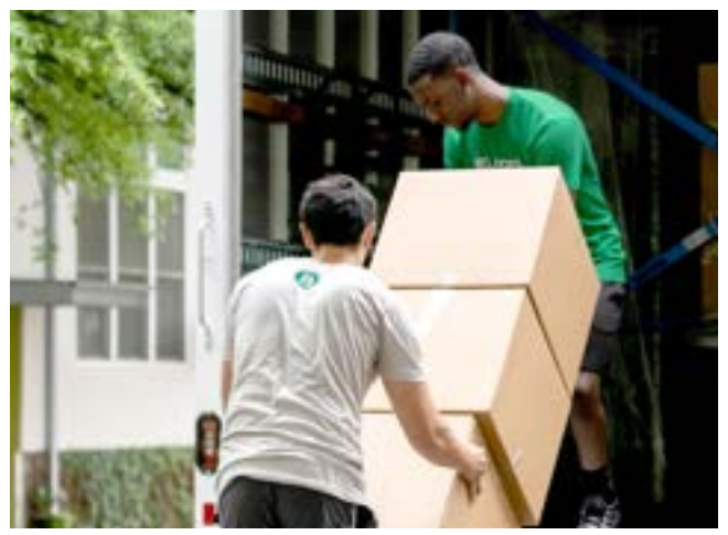
YOUNG PEOPLE ARE FINDING IT DIFFICULT TO STAY IN MAINE.

As someone who just relocated to Maine a few weeks ago, I was immediately in awe of how much the state has to offer: bustling cities, natural beauty, and—from my first impression—a visible presence of young people. On walks with the apprentice company, we are constantly encountering other young folks on the street, in coffee shops, in thrift stores, and more. Before moving, I was aware that Maine featured a predominantly older demographic—and I do recognize that by being an urban area, Portland is an exception to that fact. However, after researching further, I discovered that to Maine's young population, cities like Portland are merely a drop in the bucket toward the motivation to stay in-state. In fact, many young people are not enticed by the idea of living in Maine long-term whatsoever. In Saint Dad, we see the Casey family grapple with this choice of many of their friends and neighbors to move out of state. The looming lack of job opportunities, financial stability, and cultural/ social initiatives statewide are pushing young people to move out of Maine while they canhaving a positive effect on their personal longevity, but a negative impact on the longevity of Maine.