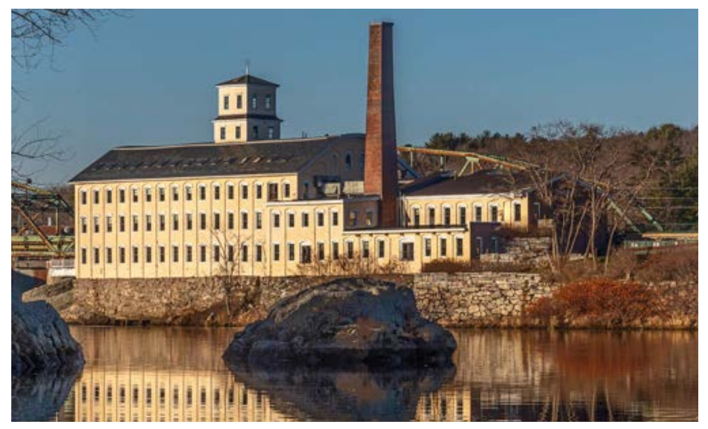
THE HISTORIC PEJEPSCOT PAPER COMPANY IN TOPSHAM, MAINE

Here in Portland, the crisis is especially visible. In May of this year, the city of Portland cleared an encampment of nearly 150 people living in tents along the Bayside Trail. According to the January census, there are over 4,200 people living in Maine who are currently unhoused. Portland has simultaneously welcomed over 1,000 asylum seekers this year, and the city does not currently have the infrastructure to provide enough resources for all those needing shelter. Portland already houses approximately 1,200 people each night across three different shelters and hotels. This is not unique to Portland; all over the state, tent cities have been popping up as shelters are continually maxed out.