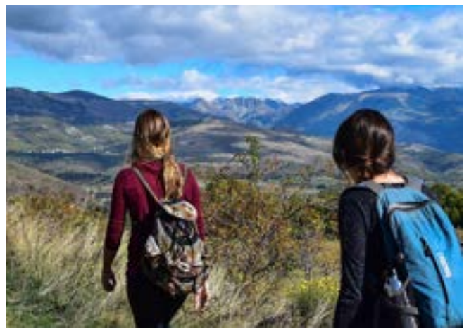
YOUNG PEOPLE HIKING.

Maine's $8-billion, 30,000-job forest economy to $12 billion by 2025.